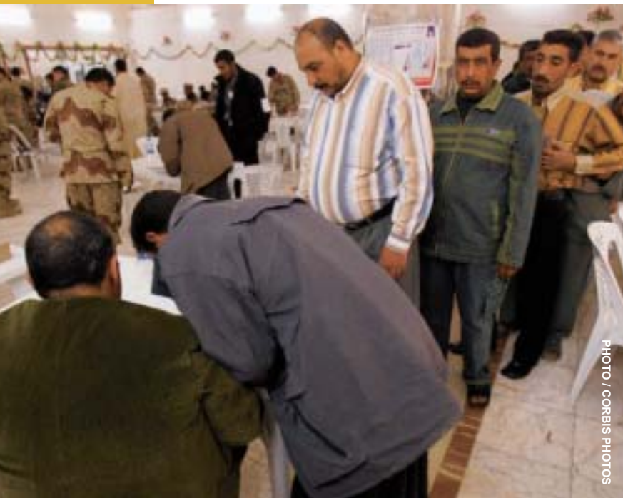
Iraqi citizens voting in a general election.

Since the approval of the Constitution, Freedom House has supported Iraqi civic activists, including prominent women's rights advocates who are working to ensure that the implementation of the Constitution reinforces civil and political liberties. Working with the Iraq Foundation, Freedom House convened a workshop that brought democratic activists in Iraq together with a group of international rights experts, resulting in the formation of "Iraq Democracy Watch," an indigenous government watch dog organization.