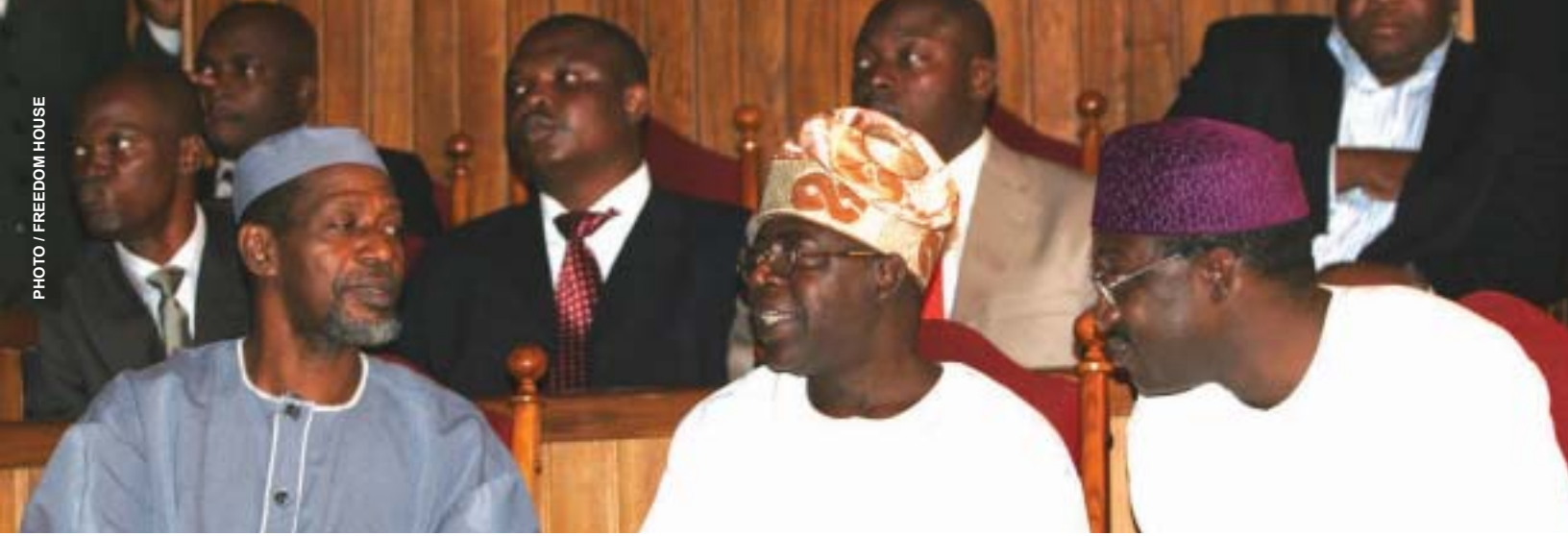
African leaders at the Wole Soyinka Awards for Investigative Journalists.

and to combat the status quo of impunity in which exists in too many areas. As a result of Freedom House's assistance, human rights defenders are for the first time using new customized software and a documentation database (first piloted in Oaxaca and Chihuahua) to systematically document violations both of existing Mexican laws and of international treaties and covenants which Mexico has ratified. At the same time, professional media training provided by Freedom House to Mexican NGOs has enabled local organizations to expand their outreach to international and national media, bringing greater attention to the human rights violations that continue in the country.