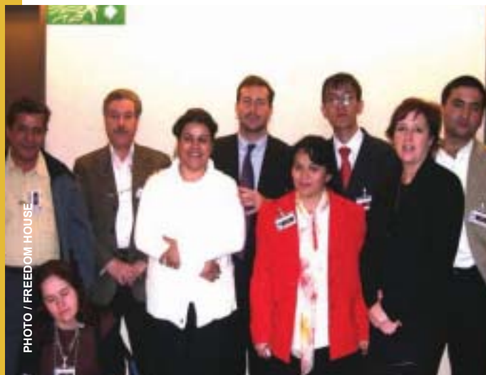
Freedom House delegates from Central Asia and North Africa to the UN Commission on Human Rights annual meeting in Geneva.

Democracy Caucus to become more active on the issue—in particular, to support an improved membership mechanism to the Council. When presented with a draft text outlining the proposed Council, however, Freedom House parted with its allies in declaring the text insufficient in guaranteeing that the Council is a genuine improvement over its predecessor. During this first year of the Council's existence, Freedom House will continue to work with the UN Democracy Caucus, with allies, and alone to ensure that countries that are human rights supporters are elected to the Council, and that the U.S. remains engaged on the issue.