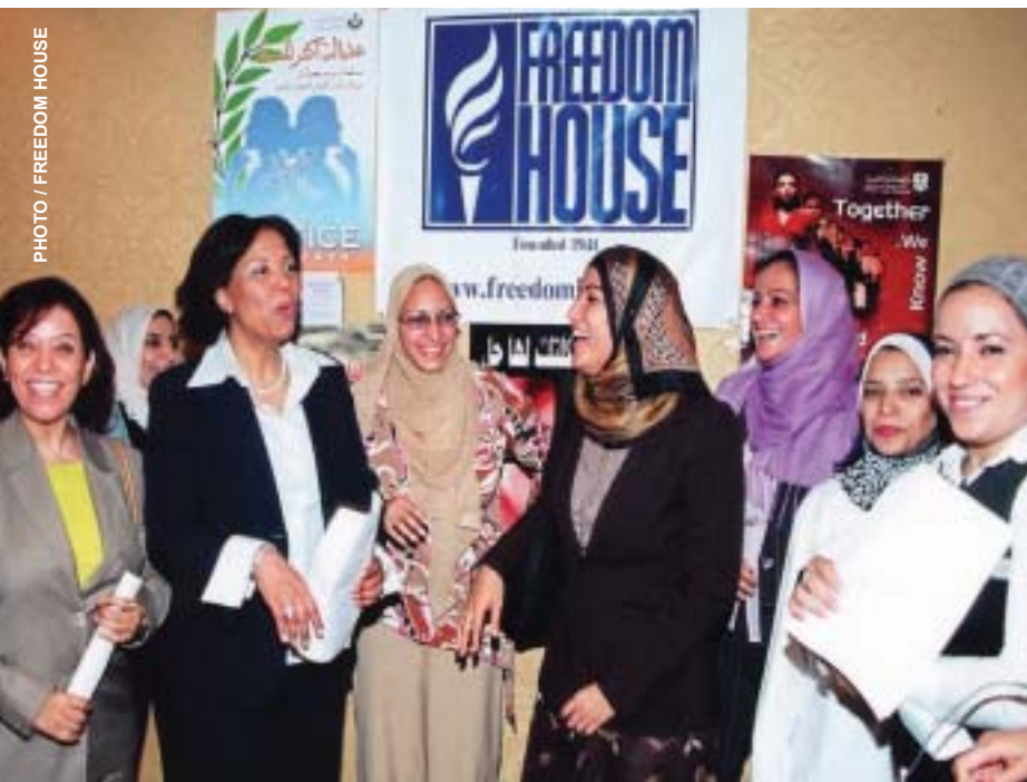
Participants at Freedom House workshop on women's rights in Cairo, Egypt.