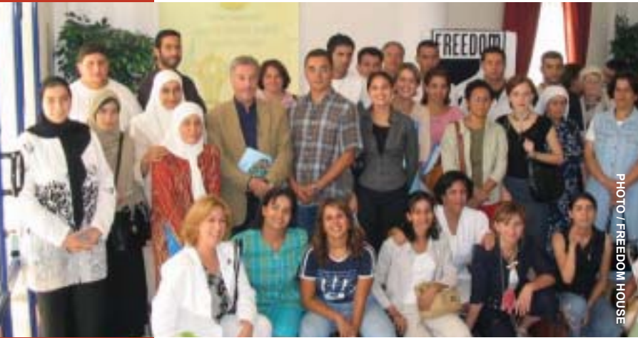
Freedom House training participants in Algeria

In the wake of the September 29, 2005, referendum on General Amnesty in Algeria, Freedom House continues to support cooperation among human rights and victims' rights organizations in that country. Specifically, Freedom House supported trainings and discussions on national reconciliation and transitional justice, which resulted in a joint declaration calling for the establishment of an independent truth commission to pursue reconciliation measures that entail thorough investigations into human rights violations perpetrated by both government and Islamist forces during the civil war.