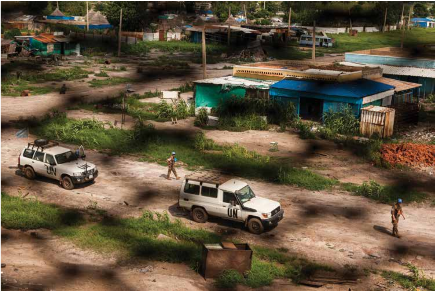
UN peacekeepers patrol the abandoned town of Bentiu, South Sudan (June 2014).