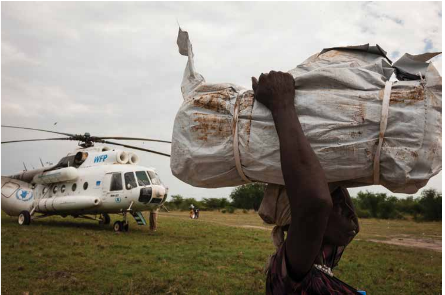
A woman carries tarpaulins from a helicopter to the distribution center in Jonglei State, South Sudan (November 2013).