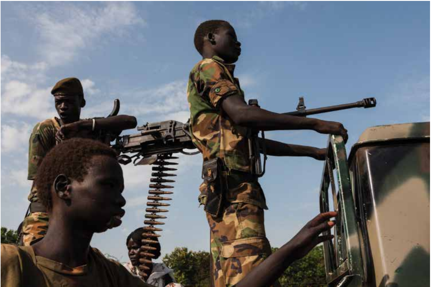
A truck stops at the market and unloads government soldiers in Rubkona, South Sudan (July 2014).