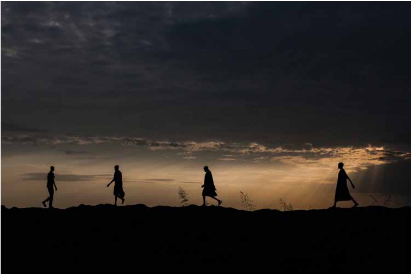
Just before dawn, IDPs walk along the dirt wall that surrounds the UN base in Bentiu, South Sudan (July 2014).