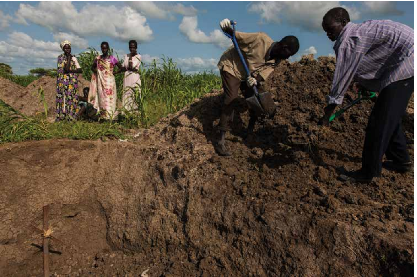
Mothers watch as their children are buried in a mass grave in Bentiu (June 2014).