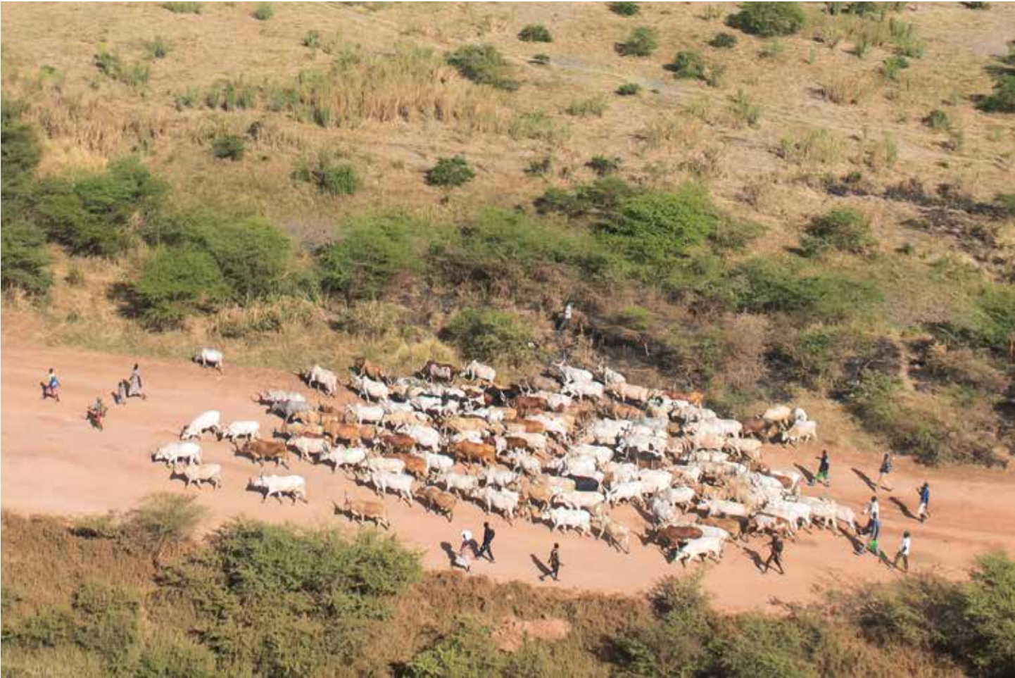
Youth move cattle near the town of Bentiu, in Unity state (November 2015).