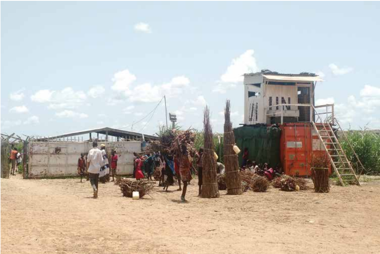
Women returning to Bentiu POC from collecting firewood outside the camp (August 2015).