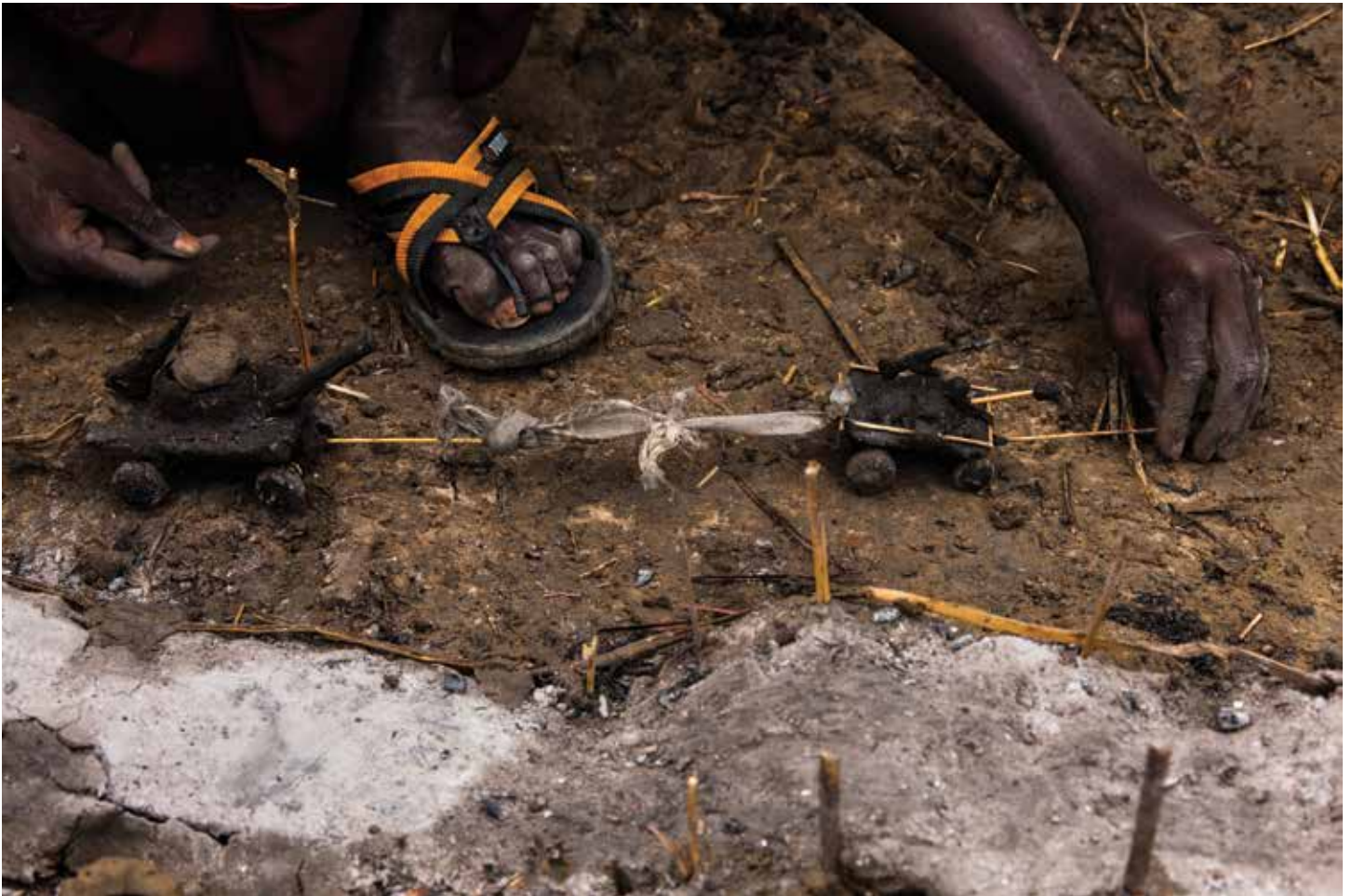
A boy plays with tanks made out of mud in the IDP camp inside of the UN base in Bentiu, South Sudan (June 2014).