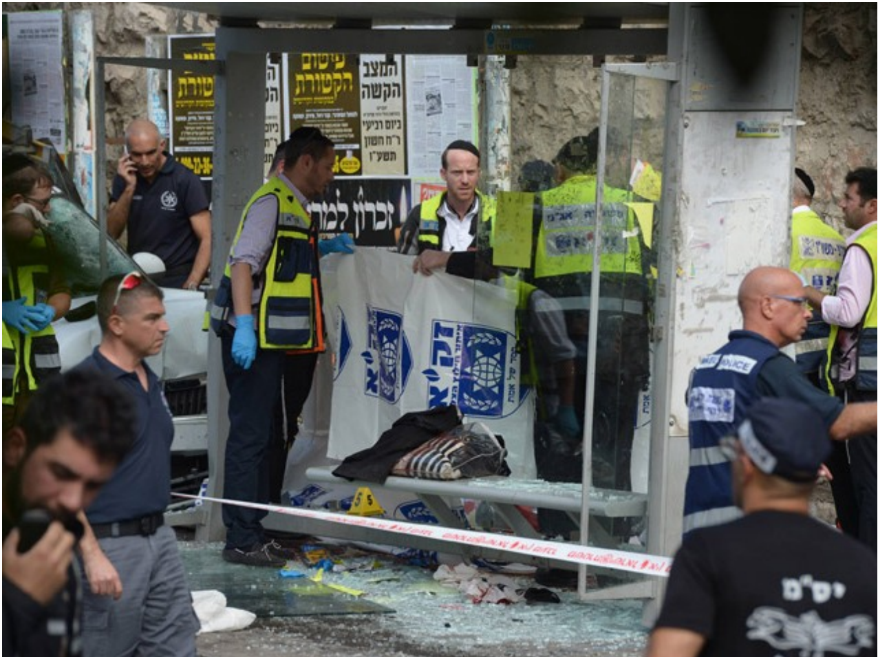
Scene of car-ramming and stabbing attack at bus stop on Malkhei Yisrael Street in Jerusalem