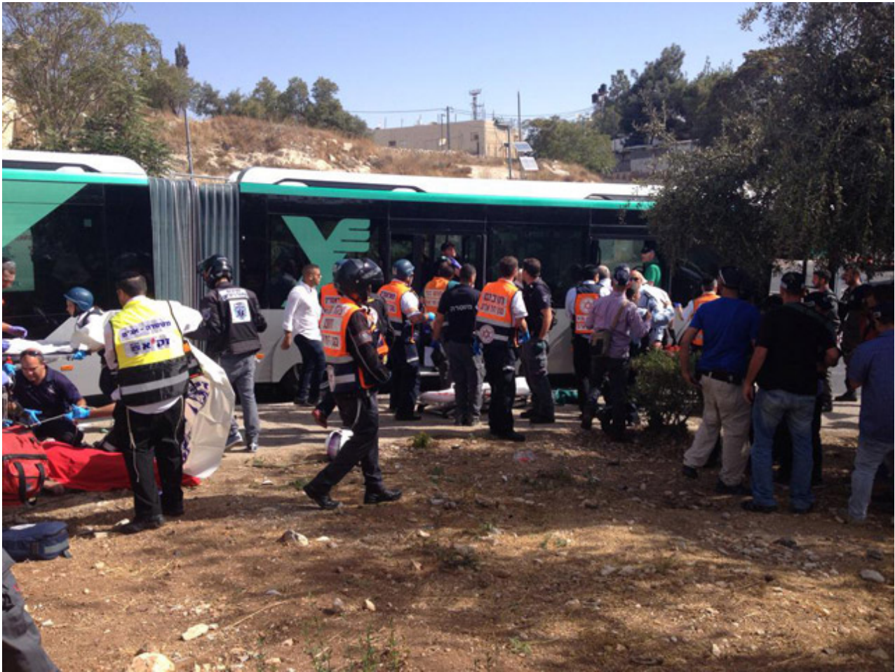
Scene of attack on Egged bus in East Talpote neighborhood in Jerusalem