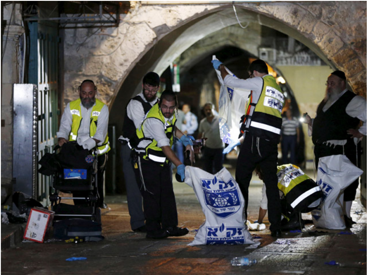
Zaka Rescue and Recovery team at scene of stabbing attack Jerusalem's Old City