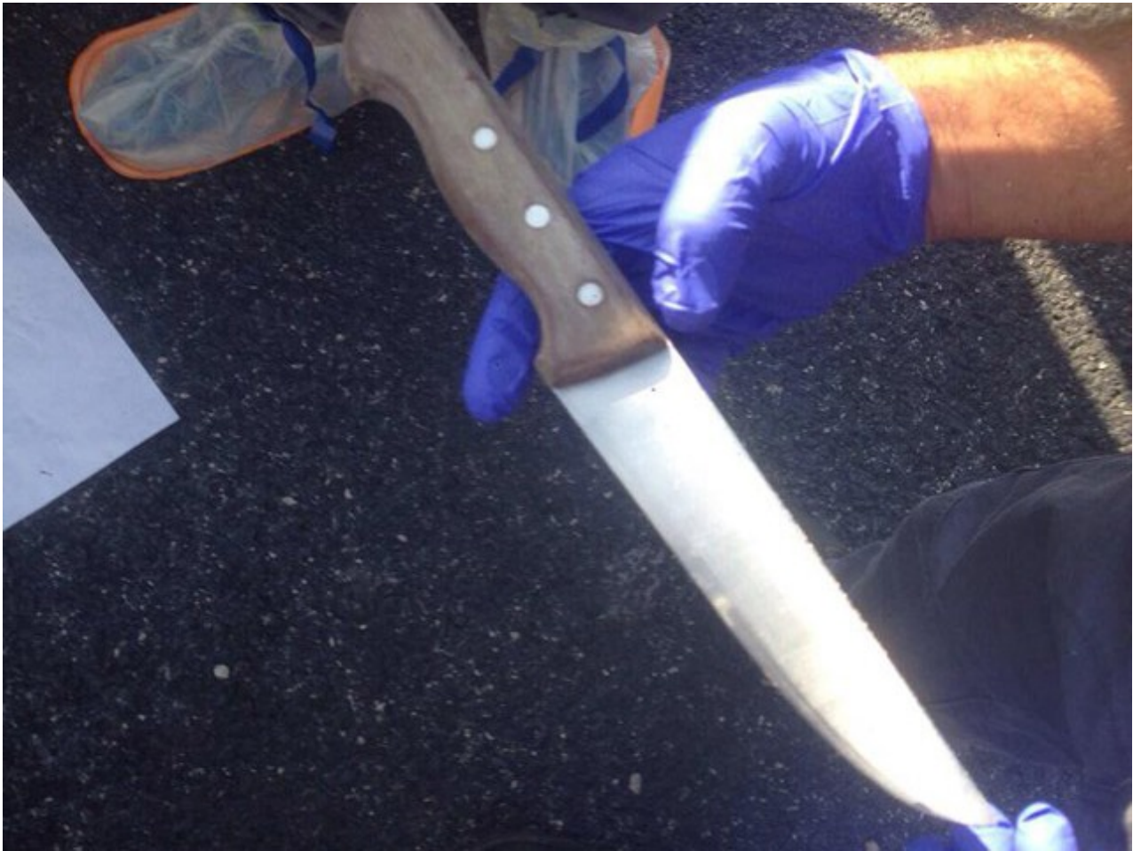
Knife used in terror attack in Jerusalem