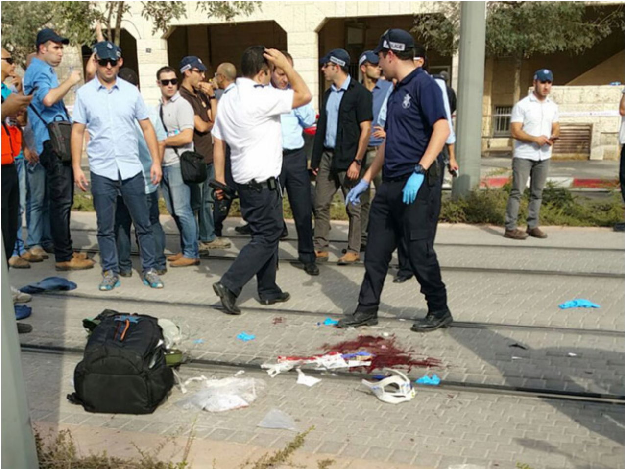
Scene of terror attack in Pisgat Zeev neighborhood of Jerusalem on Oct 12. 13-year-old boy riding his bike critically wounded.