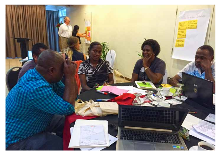
"How to Use the V-Dem Data?", Workshop for Democracy Practitioners, Melanisia, 2015.

Varieties of Democracy (V-Dem) takes a unique approach to conceptualizing and measuring democracy. We adopt a multidimensional and disaggregated approach acknowledging the complexity of the concept of democracy as a system of rule that goes beyond the simple presence of elections. The V-Dem distinguishes between seven high-level principles of democracy: electoral , liberal , participatory , deliberative , egalitarian , majoritarian and consensual , and collects data to measure these principles.